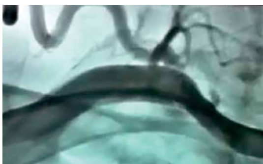
Figure 3. Final angiography displaying the complete sealing of the dissection

The presence of SAD should be suspected when there is resistance to the wire or catheter advancement, especially when the patient has a newly developed pain in the clavicular region. Early recognition of the SAD and treatment are of utmost importance to prevent acute hand ischemia. After the diagnosis, the dissected segment should be crossed by meticulous manipulation of 0.035 inch hydrophilic guidewires in the true lumen. We crossed the dissection with the 0.035 inch hydrophilic guidewire. The dissection segment is crossed with the guiding catheter, which is held in place at the level of the ascending aorta