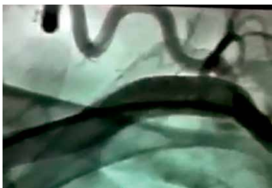
Figure 2. Guiding catheter and Glidewire were carefully advanced through the true lumen, confirmed by subclavian angiography