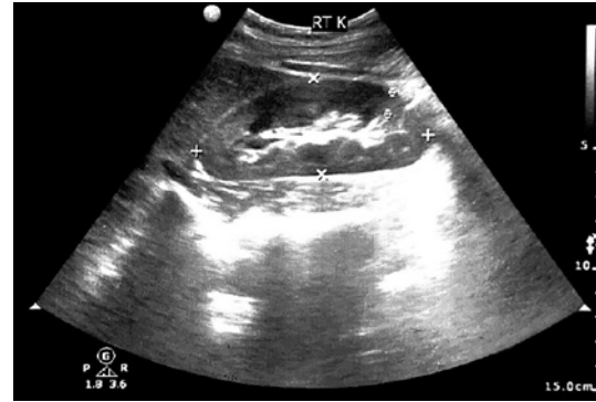
Figure 1. Ultrasound image showing dimensions of the right kidney in a participant

Weight was also positively correlated with kidney dimensions. The right kidney dimensions had