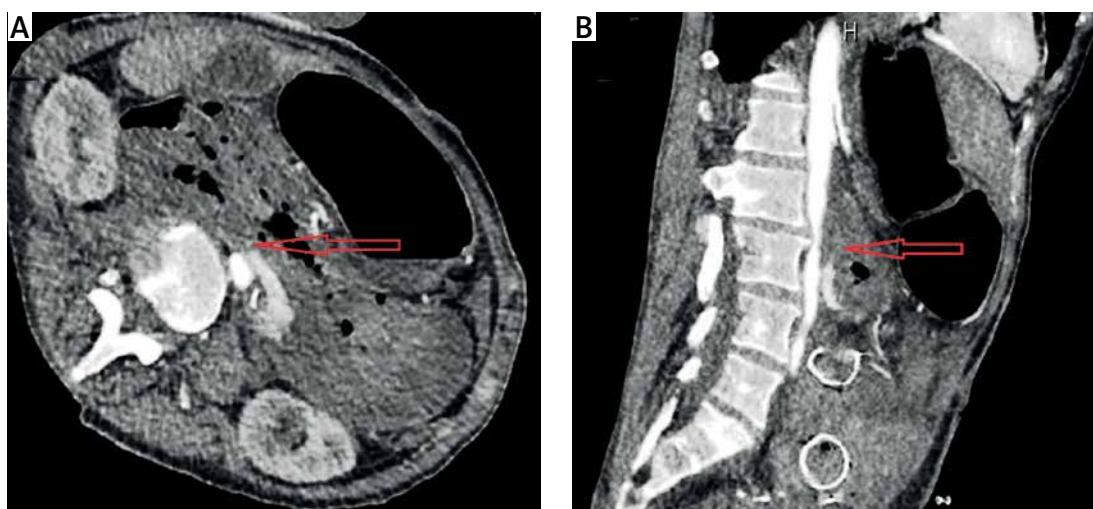
Figure 2. A – CT angiography showing the intravenous contrast extravasation in the lumen of the duodenum (red arrow). B – The migrated duodenal stent is also recognised (red arrow)

For imaging, several methods have been proposed, the most useful being oesophagogastro-duodenoscopy and computed tomography (CT). The choice of imaging method depends on the patient's condition, the presence or not of bleeding, and its severity. In the case of massive bleeding, the patient should be taken directly to the operating room without further delay. In acute bleeding in stable patients, endoscopy is usually performed but with low accuracy in the diagnosis of